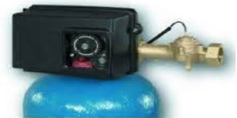
1 ½” valve